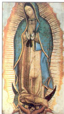
Pray for Unborn Human Life

To order either of these prayer cards free of charge (donations suggested), send your request to: