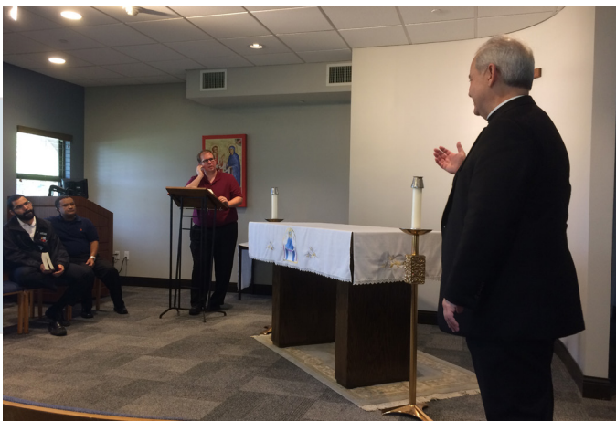
In addition to constructing the new residence hall at St. Vincent DePaul Regional Seminary , we also built a state of the art preaching lab to develop the seminarians' homiletic skill as part of the project as part of a joint effort with all seven diocese of Florida.