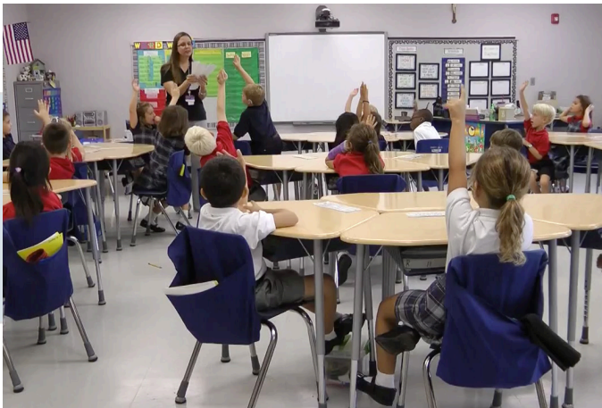
The students at St. Anthony of Padua Catholic School , our oldest regional school, are now enjoying a new facility, which provides a well-rounded, supportive and Christ-centered educational experience.