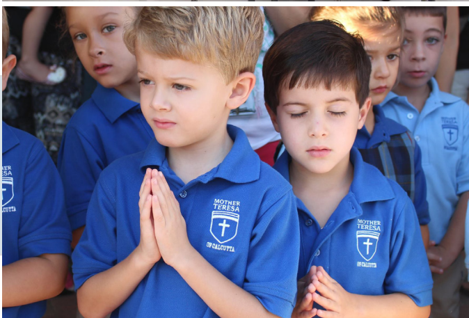
Mother Teresa of Calcutta Catholic School in Lutz opened in the fall of 2015, to develop young people who strive for academic excellence, respect the dignity of each individual and foster service to others.