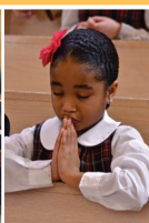
Catholic Education, Catechesis $1.8m