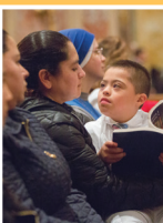
Family, Pro-Life, Special Ministries $1.9m