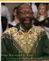
Communications, Parish Ministry $2.2m