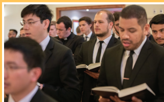
Vocations and Clergy $5.9m