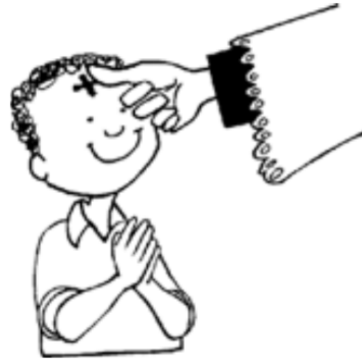
Ashes are put onto our forehead.