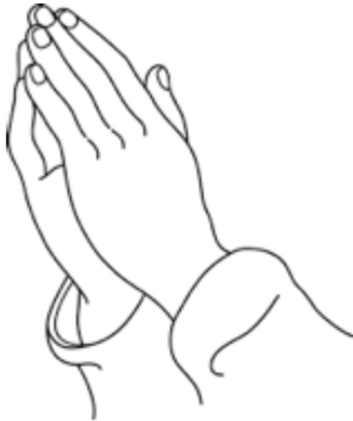
We say a prayer to God.