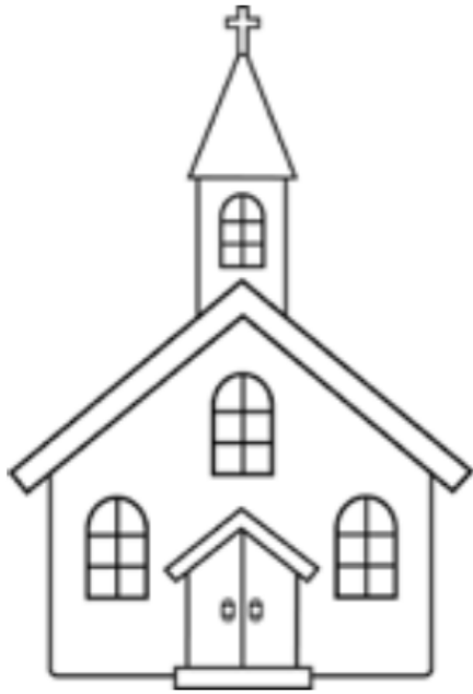
We go to Church.