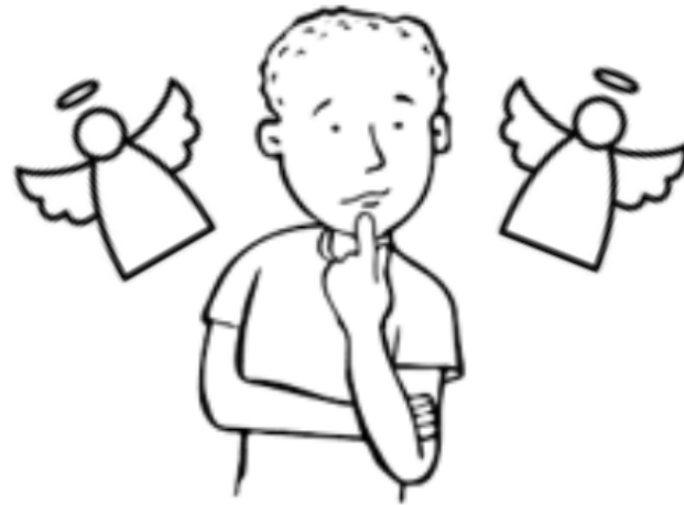
We think about how we can be a better person during Lent.