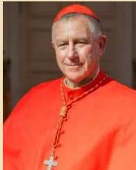
Sunday Plenary Speaker Cardinal John Dew, D.D. Archbishop of Wellington, New Zealand