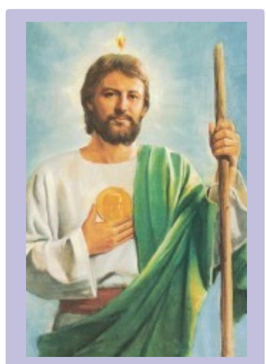
JOIN US ON OCTOBER 28 FOR A UNITED DAY OF PRAYER TO ST. JUDE, PATRON OF IMPOSSIBLE CAUSES.

Domestic Violence Awareness Month Resource Kit