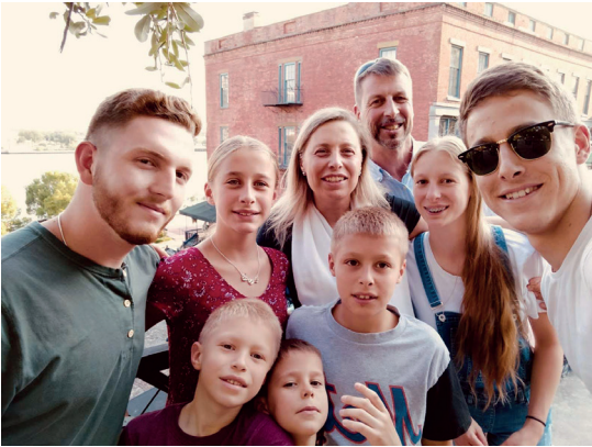
Da Ponte Family, Venice (Italy) - Bridgeport (USA)