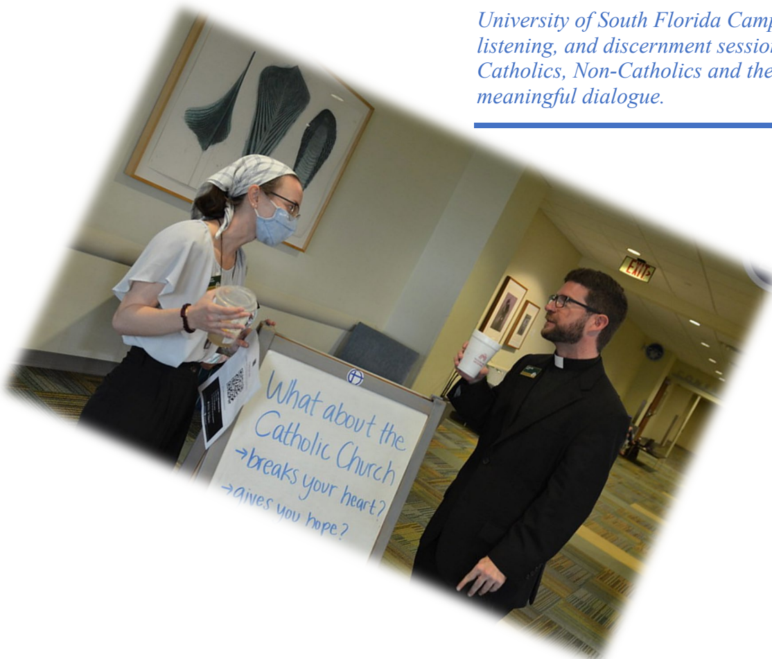
University of South Florida Campus Ministry Synod listening, and discernment sessions attracted many Catholics, Non-Catholics and the unchurched into meaningful dialogue.