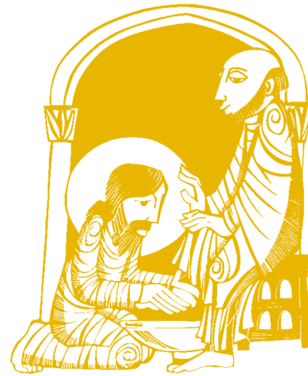
Clip Art for Year C Copyright ©1994, Archdiocese of Chicago. All rights reserved.