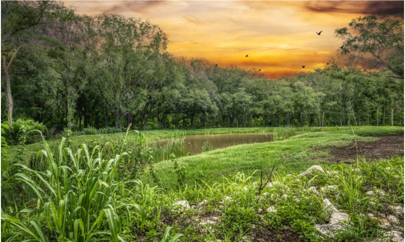
An artistic photo of Resurrection Catholic Cemetery, located on a 120-acre nature preserve in Hillsborough County.