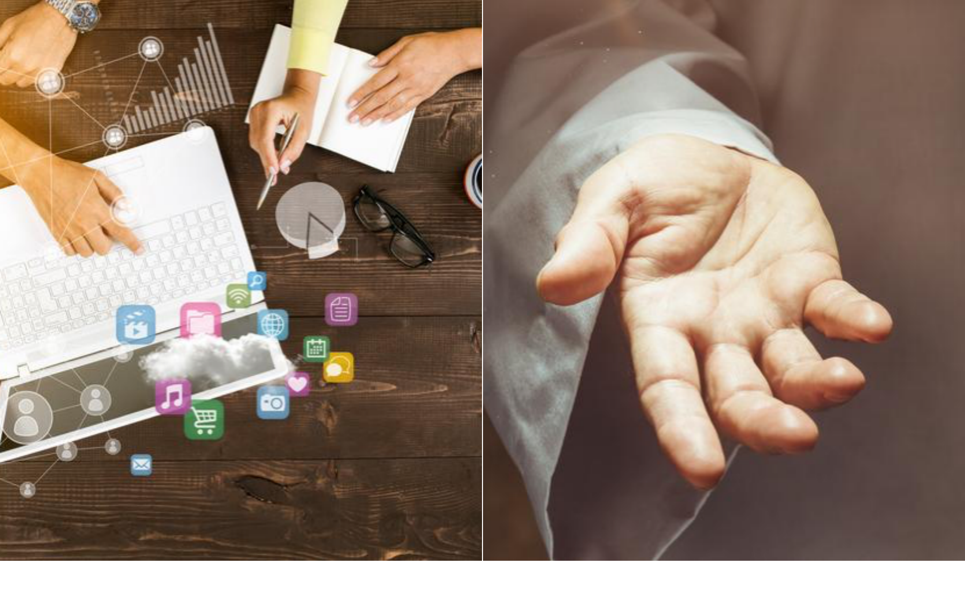
Marketing vs. Catholic Communication