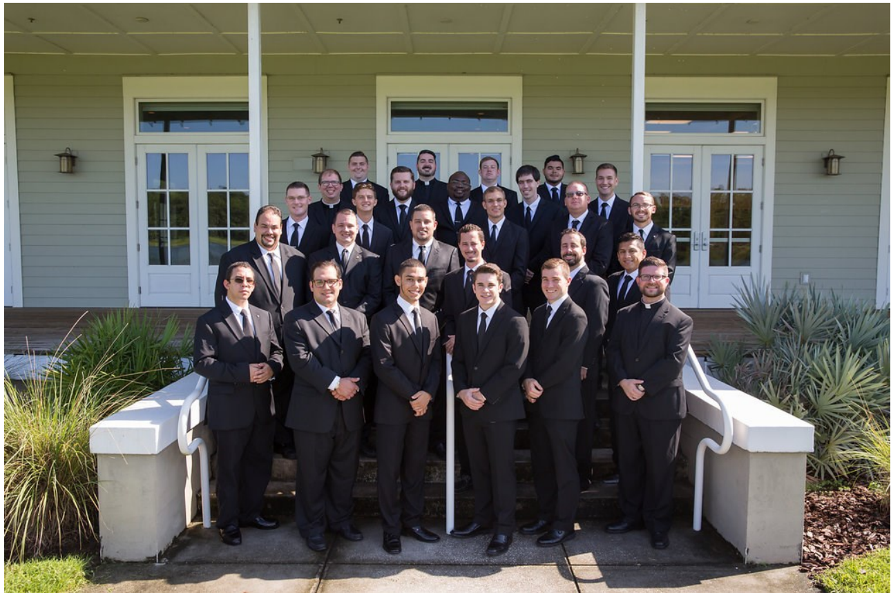
2017/2018 Diocese of St. Petersburg Seminarians